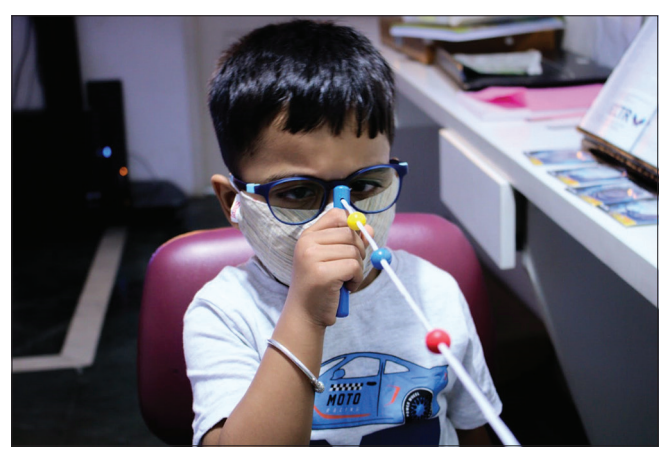
Figure 3: Brock string

enhance early detection of DES, and promote good eye health measures in our young citizens is the need of the hour.