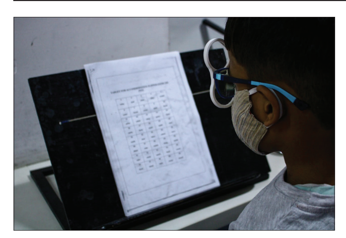
Figure 1: Flippers