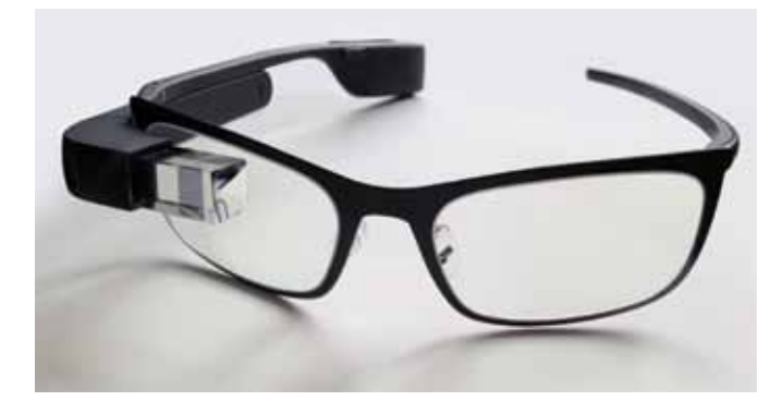
Figure 1. Although the Google Glass device pictured is not being sold at present, it represents the type of wearable technology which is likely to become more prevalent in the future.

The area of wearable technology seems likely to expand dramatically over the next 5-10 years. At the time of writing, Google Glass (Figure 1), which projected a virtual image into the superior temporal field of the right eye, is no longer being marketed to the general public. However, it seems likely that similar products will become available in the future. These may present significant issues for the optometrist. For example, in the case of Google Glass, the image was only seen by one eye, thereby creating the potential for binocular rivalry and visual interference (where two images are not clearly distinguishable from one another). Interestingly, there were many anecdotal reports of headaches and other visual symptoms when individuals were first using the device. In addition, it produced significant loss of vision field in upper right gaze (lanchulev et al. 2014). A subject who was driving, operating machinery or in motion could be severely, and dangerously, impacted by this visual field loss.