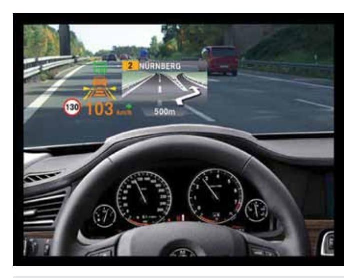
Figure 2. Head-up displays, as shown, are becoming more common in a wide range of cars.

text due to the limited screen area (approximately 3.3cm by 4.2cm).